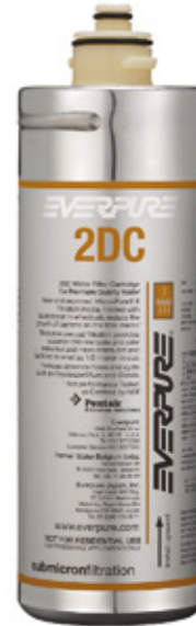
2DC Replacement Cartridge: EV9591-06

Everpure water treatment systems are covered by a limited warranty against defects in material and workmanship for a period of one year after date of purchase. Everpure replaceable elements (filter cartridges and water treatment cartridges) are covered by a limited warranty against defects in material and workmanship for a period of one year after date of purchase. See printed warranty for details. Everpure will provide a copy of the warranty upon request.